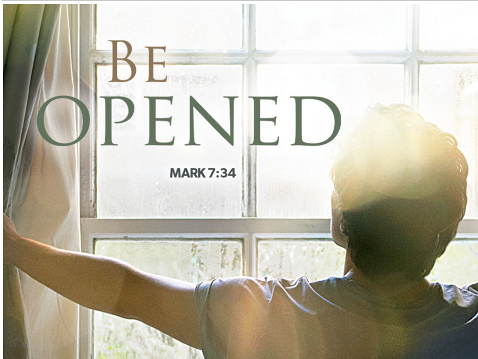
Figure opening curtains in the morning by Tara Moore. ©2022 Getty Images Plus. Used by permission.

Sixteenth Sunday after Pentecost September 8, 2024 - 9:00 AM